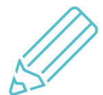
Toolkits + Resources

On Evidence-Based Practice + Performance Improvement